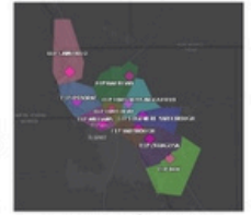
our work sites w/ ADB

This project required working around the customer's schedule to include Overnight Labor